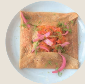
Galette au Saumon

❖ Salmon + Beet + Fromage blanc + Red Onion Pickles